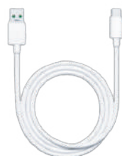
USB Cable Included