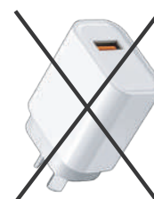
Charger Not Included