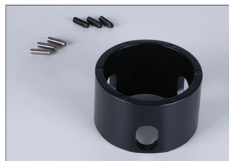
Use this adapter for a 60mm post